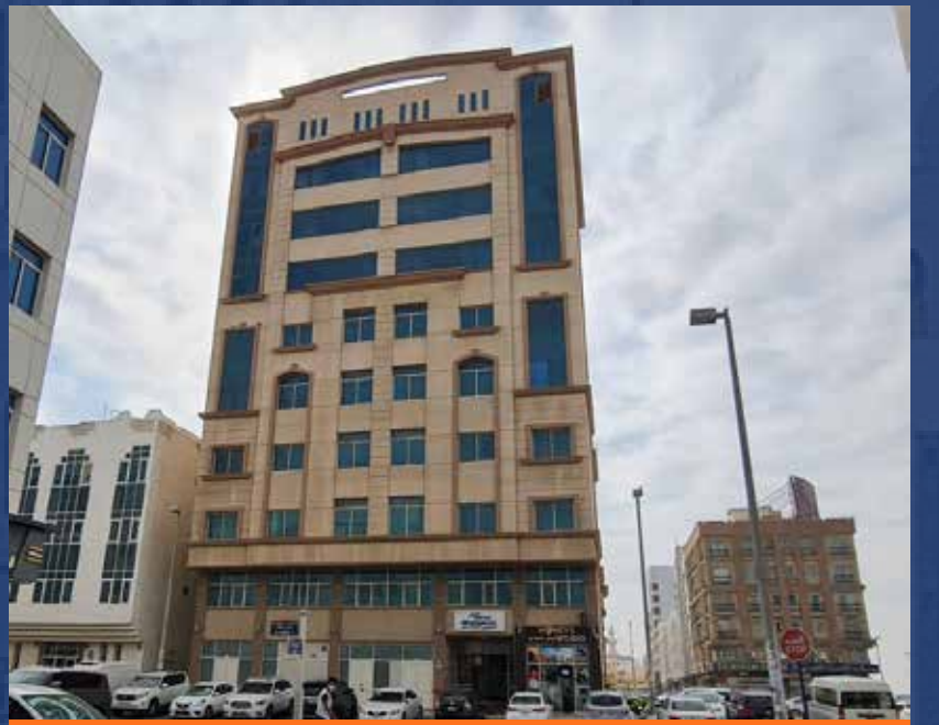
Location: Western Region Al Dhafra - Beda Zayed Madinat Zayed

17 Flats (2 Bedrooms each Flat) Location: Shabia 11 Musaffah, Abu Dhabi